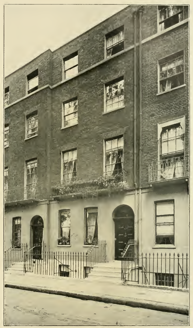
THE HOUSE IN WHICH CHRISTINA ROSSETTI DIED. 30 Torrington Square. Photograph taken in 1908,